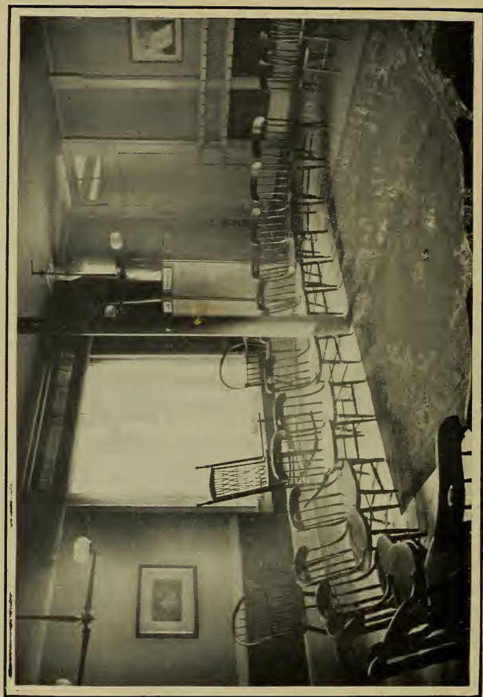
Southeast view, showing furnace hidden by a screen, visitors' chairs, window with curtain, rack for wraps and cradle roll